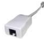
2 One-line filters